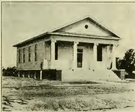
EASTMINSTER CHAPEL OF 1st CHURCH, ALMA, MICHIGAN

OF THE GENERAL ASSEMBLY OF THE PRESBYTERIAN CHURCH IN THE UNITED STATES OF AMERICA